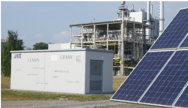
Compact lithium-ion storage system in the research environment at KIT

This large-scale lithium-ion storage system was developed at KIT on the basis of components available in the industry. Nevertheless, it offers a multitude of innovations, which can contribute to increasing economic efficiency and thus to spreading battery storage devices in various fields of application.